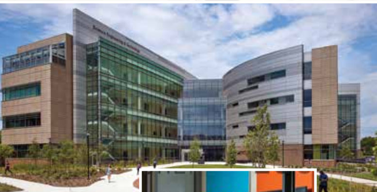
Science, Engineering, and Technology Building