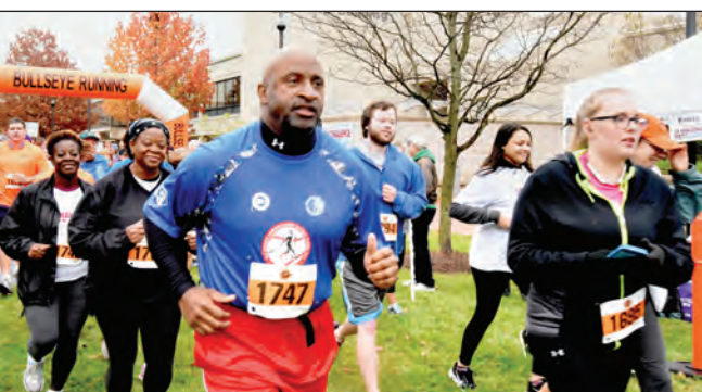
CHALLENGE RACE 2015